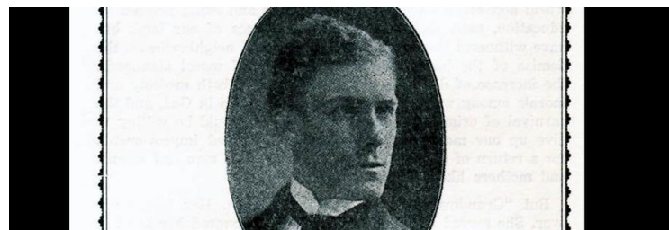
(Image from the cover of The Christian Youth 2.11 [October, 1912]).